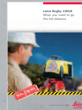
Leica Rugby 100LR The long range construction laser