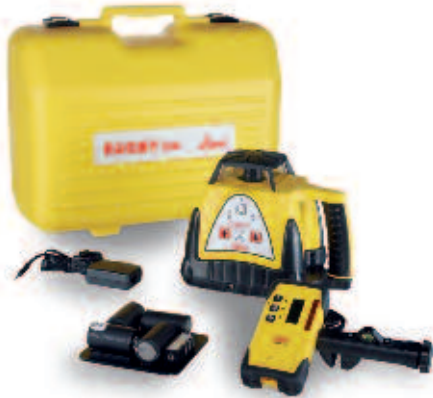
A recommended Rugby 100 package shown with the Rod Eye Sensor

Leica Geosystems's warranty offers complete coverage of the internal self-leveling system no matter what. Should any accident or knockdown occur, all repairs to the internal assembly will be done at no charge.