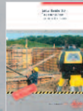
Leica Rugby 50 The one-button construction laser