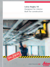
Leica Rugby 55 The multipurpose construction laser

Laser class 2 in accordance with IEC 60825-1 and EN 60825-1 Laser class II in accordance with FDA 21CFR CH.1 § 1040