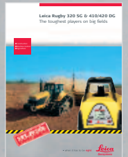
Leica Rugby 320SG & 410/420DG Single and dual grade construction lasers