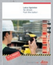
Leica Sprinter One-button digital level