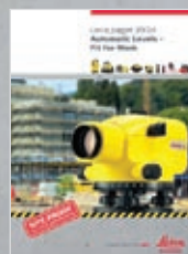
Leica Jogger 20/24 Automatic levels – Fit for Work

Ask your local Leica Geosystems dealer for more information about our TQM program.