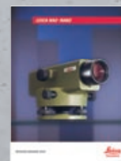
Leica NA2/NAK2 The classical, high-precision level