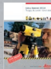
Leica Runner 20/24 Robust and value-priced automatic levels