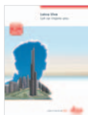
Leica Viva Overview brochure

Illustrations, descriptions and technical data are not binding. All rights reserved. Printed in Switzerland – Copyright Leica Geosystems AG, Heerbrugg, Switzerland, 2010. 774089en – IX.10 – RDV