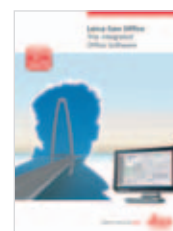
Leica Viva LGO Product brochure