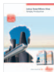
Leica SmartWorx Viva Product brochure