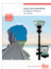
Leica Viva SmartPole Product brochure