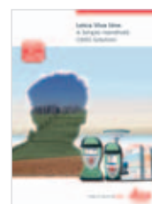
Leica Viva Uno Product brochure